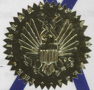
By: Virginia D. Sorkin Acting Chief Library of Congress Photoduplication Service

IN WITNESS WHEREOF, the seal of the Library of Congress is affixed hereto on February 22, 2007.